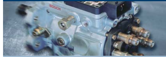
Diesel System Testing EPS