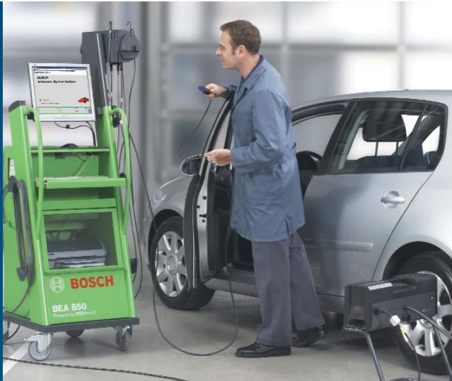
Effective emission analysis of vehicles