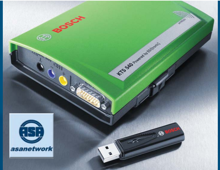
KTS 540 wireless for ECU diagnostics