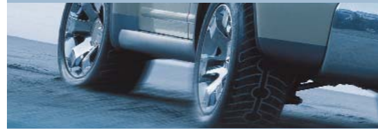
Wheel Alignment FWA

AA-DG/MKT2 - WAW 4450 GB 07.06 The right to make changes of a technical nature and to alter the range on offer is reserved