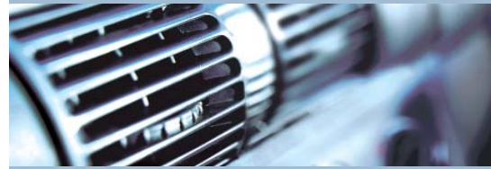
Air Conditioning Service ACS