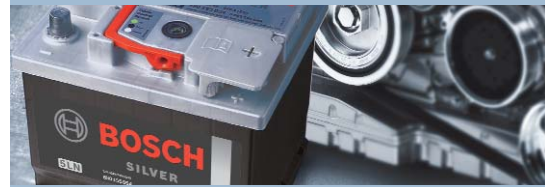
Battery Service BAT