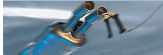
Emission Analysis BEA