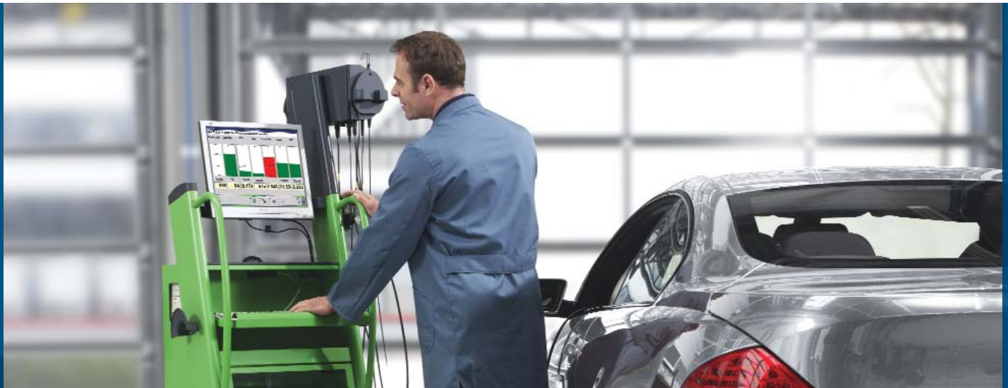
Emission analysis with BEA 850

Testing and minimizing pollutant emissions with modular measurement technology – in accordance with the latest legislation and with highest measurement accuracy. The workshop requires robust, future-proof technology to achieve this, with clear operator guidance and simple handling. The new emission analysis instruments from Bosch test technology excel through their easy and timesaving handling. Other particularly important aspects in the daily handling of exhaust-gas measuring instruments are the short run-up times and brief measuring times.