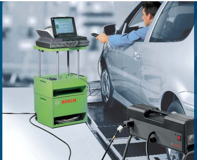
Emission analysis with the BEA Mobile on the vehicle

The exhaust-gas testing device that can be rolled quickly and easily beside the car, or even fits in the vehicle interior: BEA Mobile, in connection with a workshop PC or laptop, provides the practical and timesaving solution to mobile emission analysis of gasoline and diesel-engine vehicles.