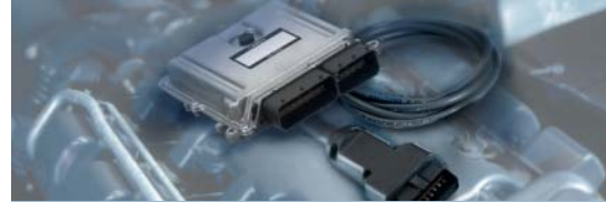
ECU Diagnostics KTS