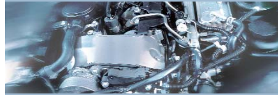
Engine System Testing FSA